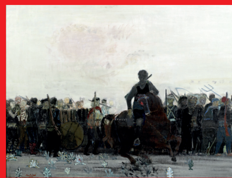
Avni Arbaş, Turkish Revolutionaries