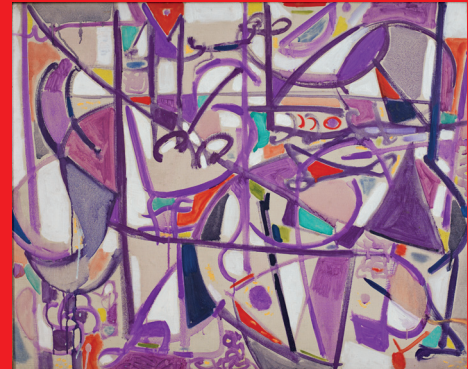
Nejad Devrim, Abstract