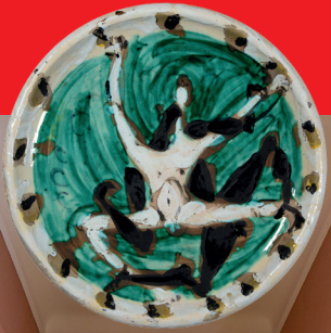
Abidin Dino, Ceramic Plate